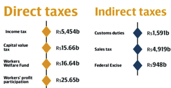
Figure 2: Breakdown of Direct and Indirect Taxes

quality to a limited pool of 'filers' (those who file their annual income and wealth returns every year).